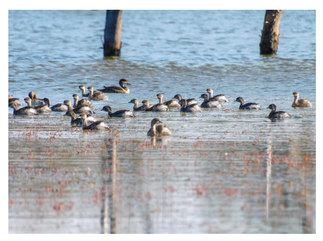
Caption: A gaggle of Australasian Grebes and a Grey Teal Duck amongst the Red Water Milfoil.