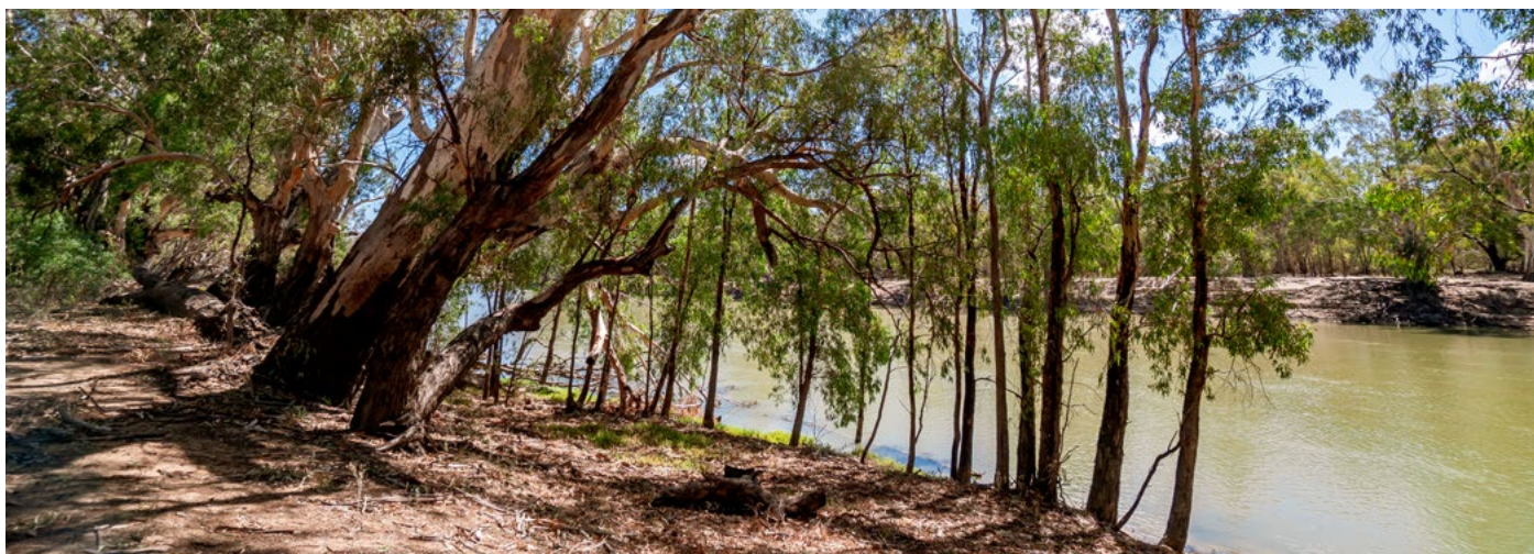
Above: Bidgee Lagoon