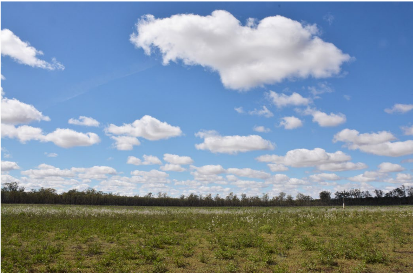
Above: Lakebed herbland Lake Hattah

Monitoring is being undertaken during the drying phase to manage unnecessary impacts on native fish.