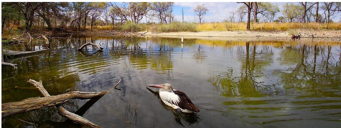
Above: Pelican enjoying the water at Outlet Creek